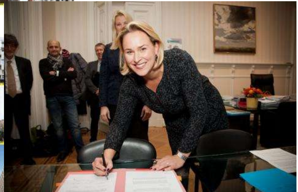
Celine Fremault, Brussels Minister for Environment