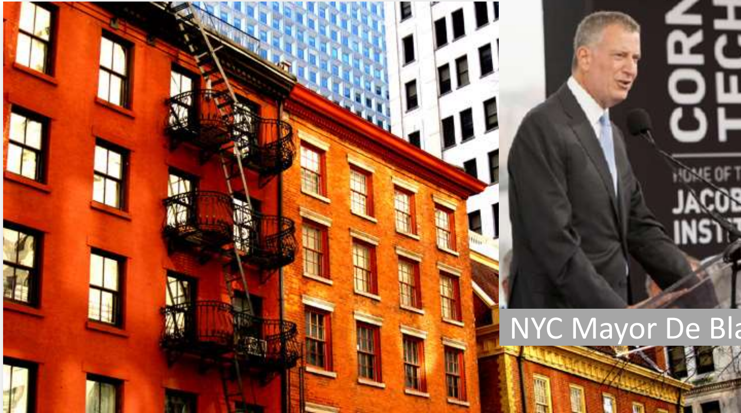
NYC Mayor De Blasio