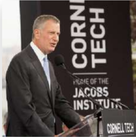
New York City