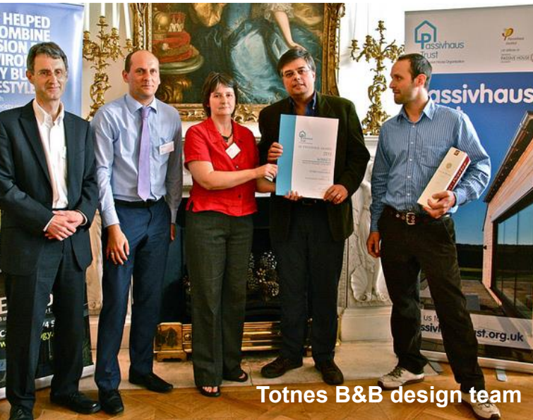
Totnes B&B design team