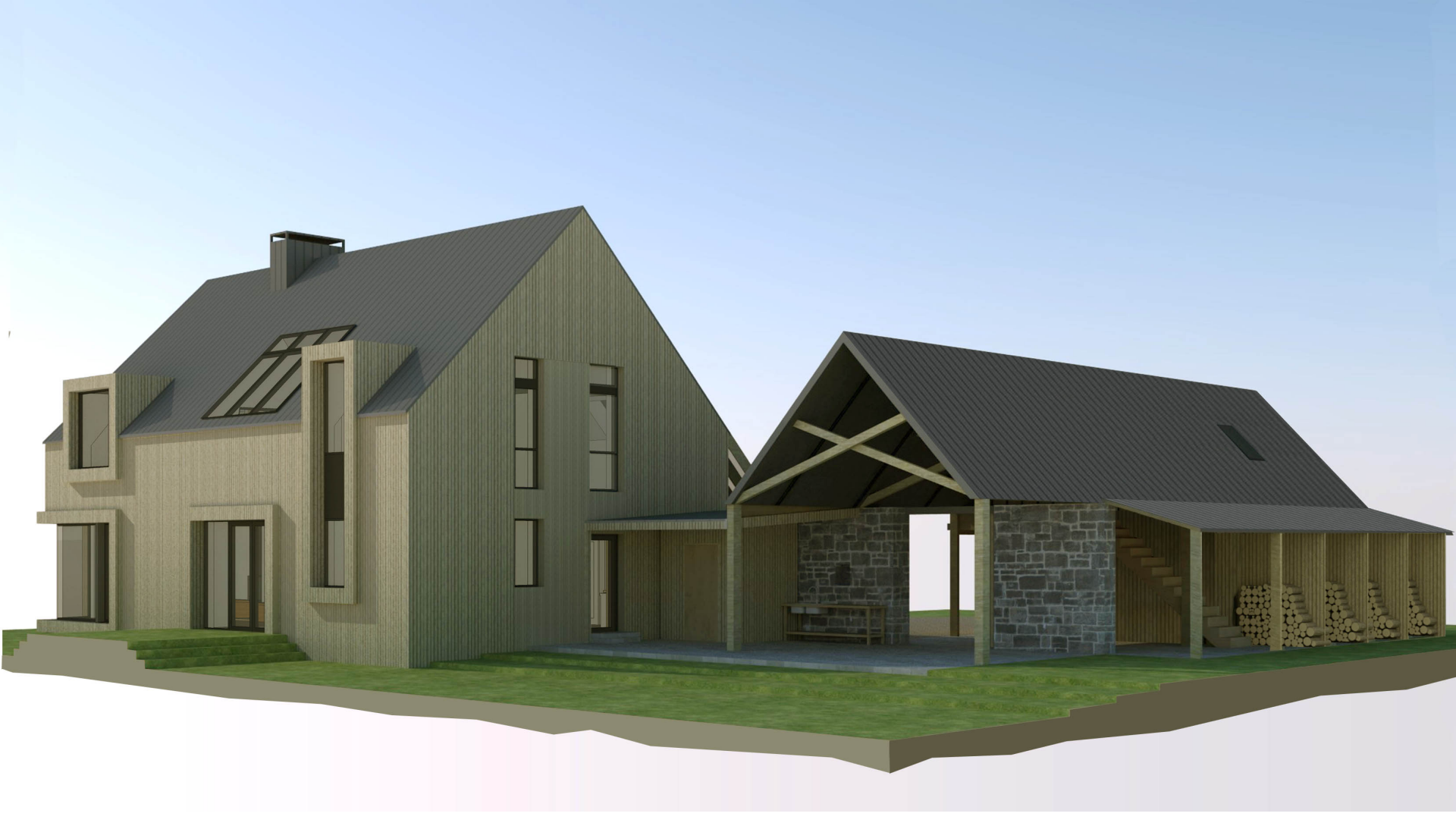
Ferndown - Sam Foster Architects