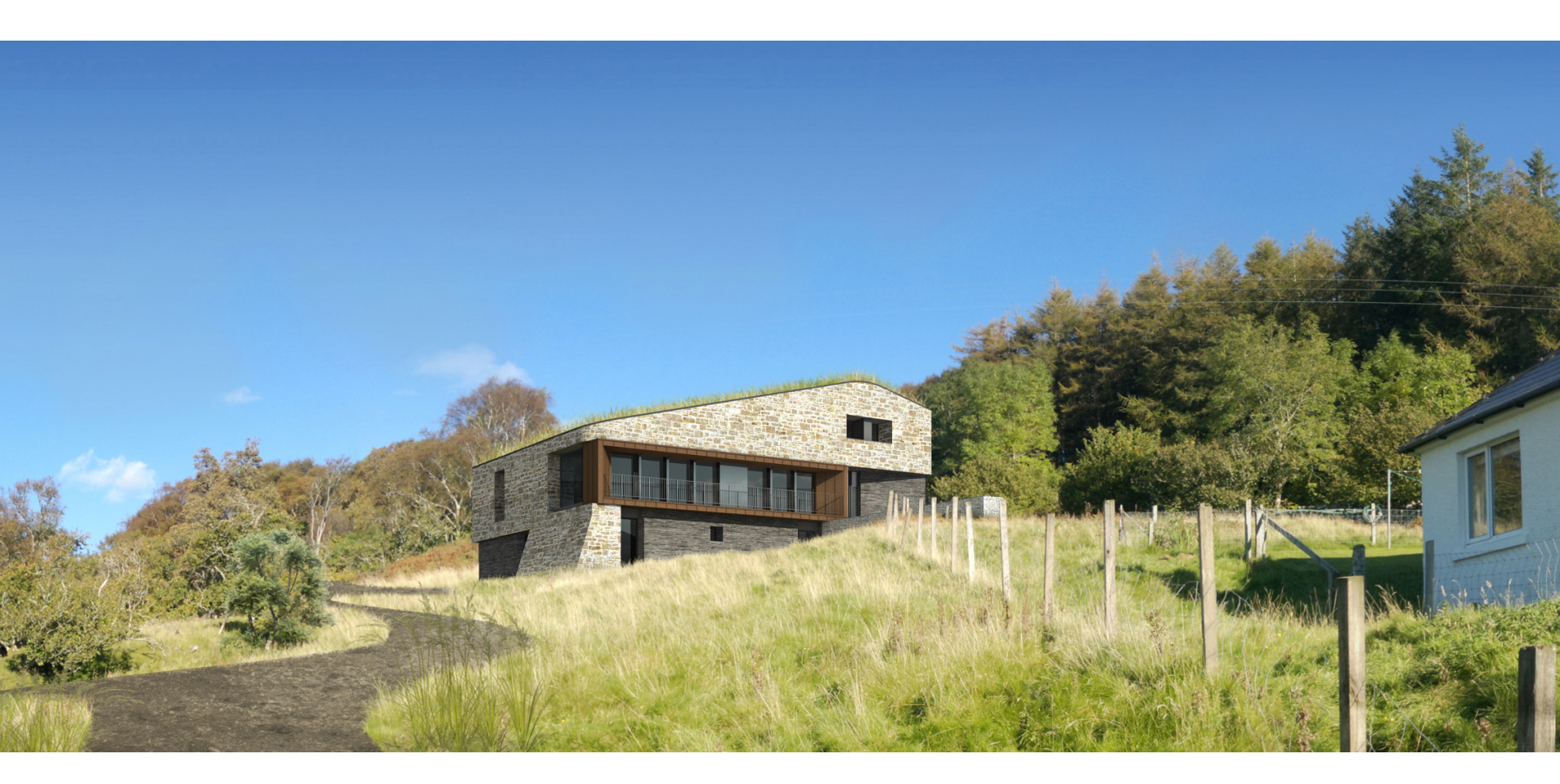
Portree - Rural Design