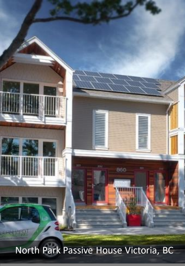
North Park Passive House Victoria, BC