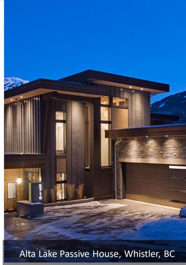
Alta Lake Passive House, Whistler, BC