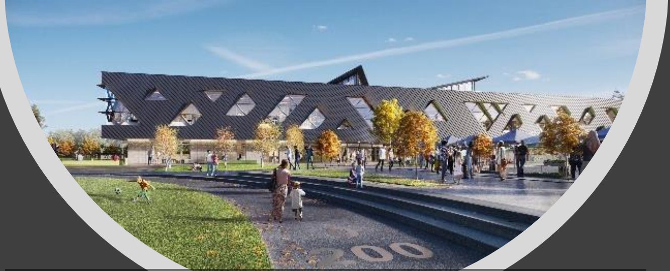
Clayton Community Centre