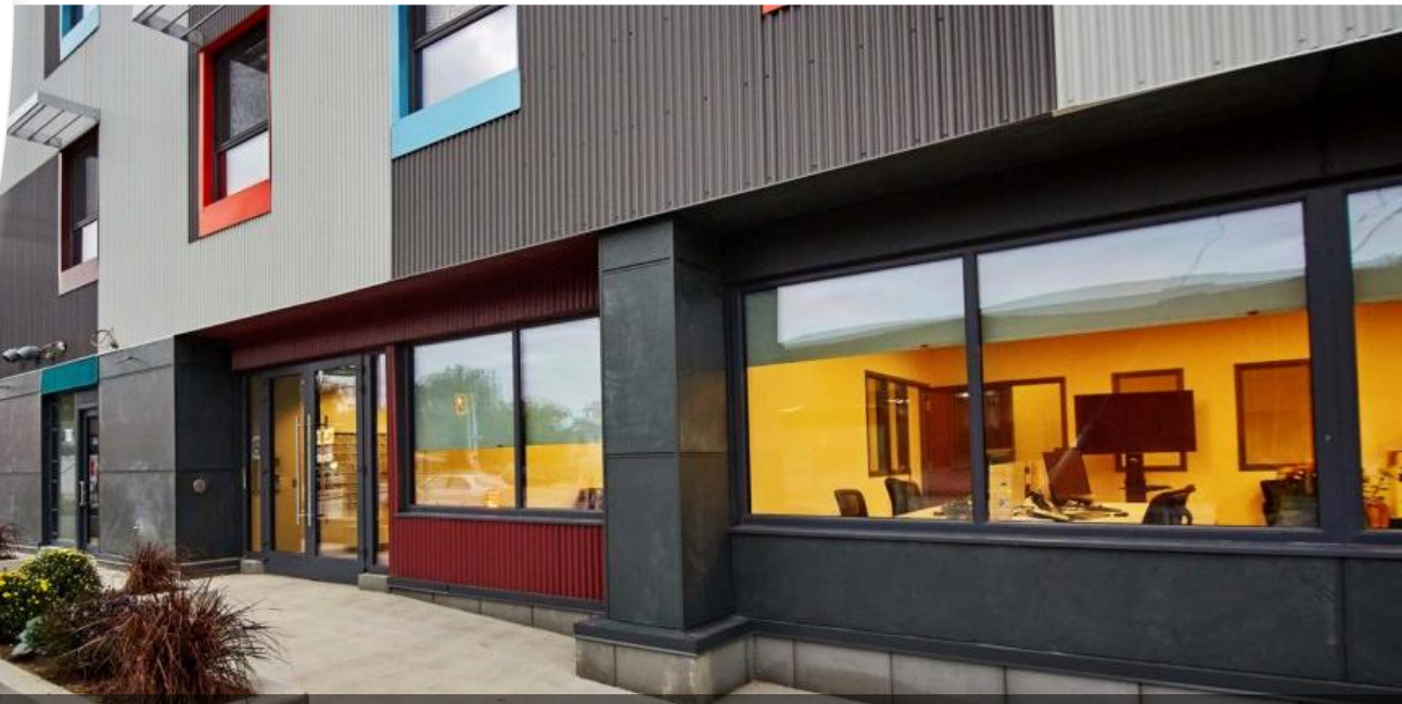
Parkdale Landing retrofit, Hamilton, ON