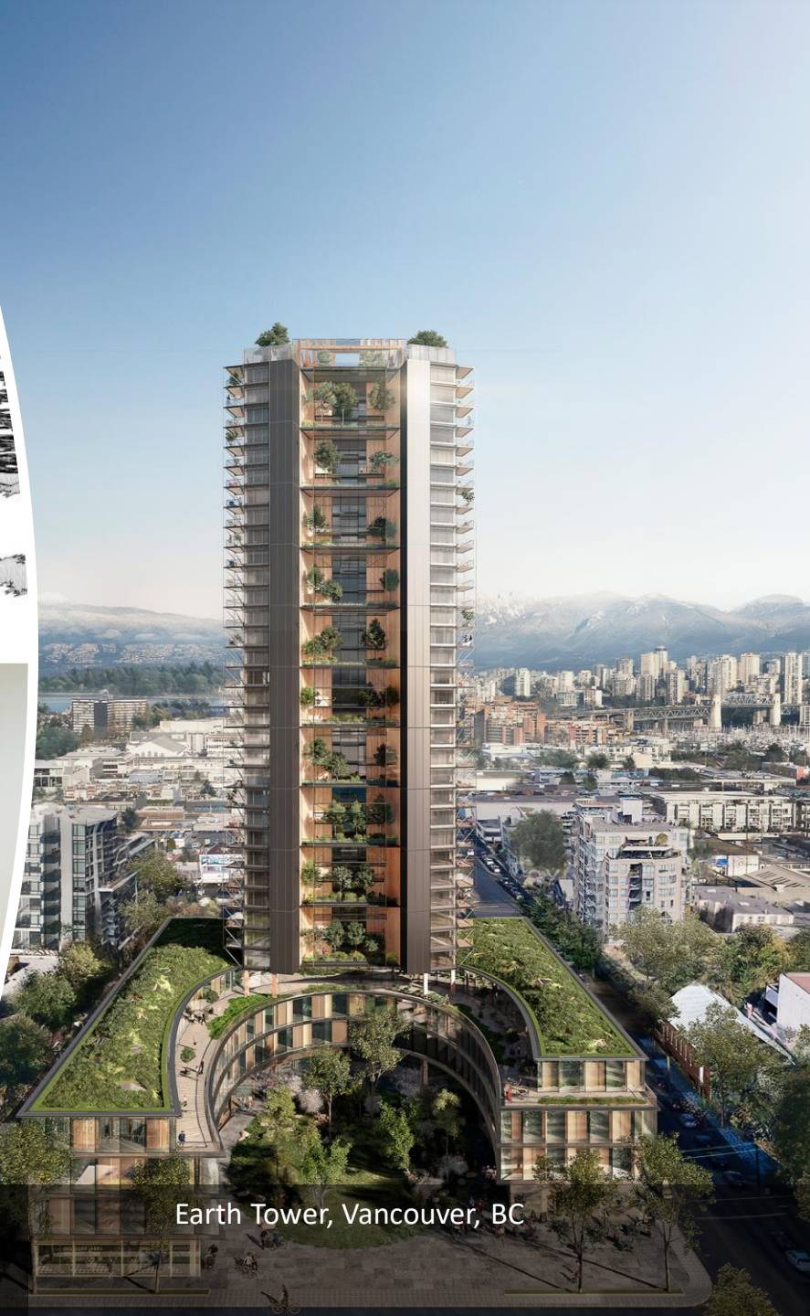
Earth Tower, Vancouver, BC