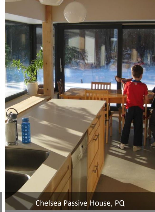
Chelsea Passive House, PQ