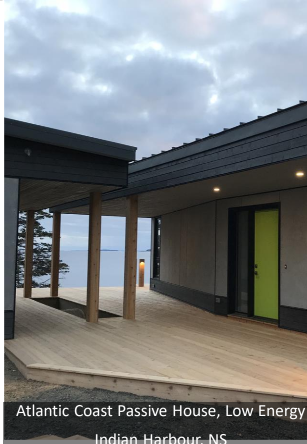
Atlantic Coast Passive House, Low Energy Indian Harbour, NS