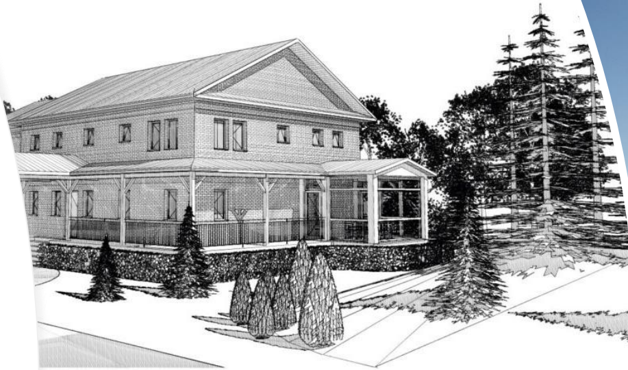
Red Castle Passive House Ottawa, ON

Ensure you have a unified, credible voice with capacity to engage